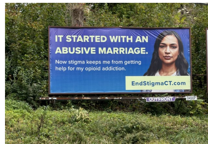
S. Main St. / Rt. 313 - Seymour