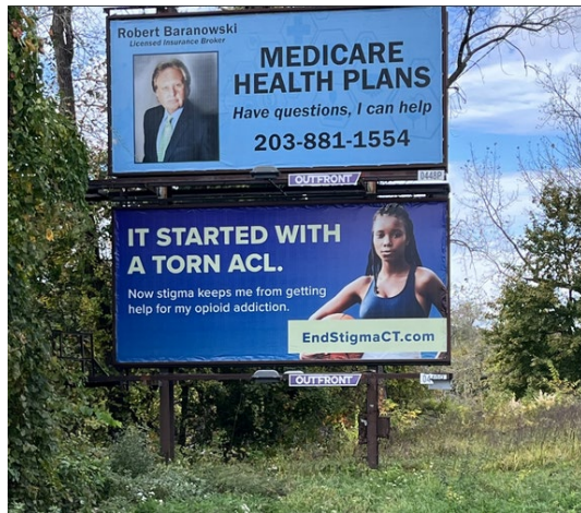
Rt. 34 / Gilbert St. - Derby