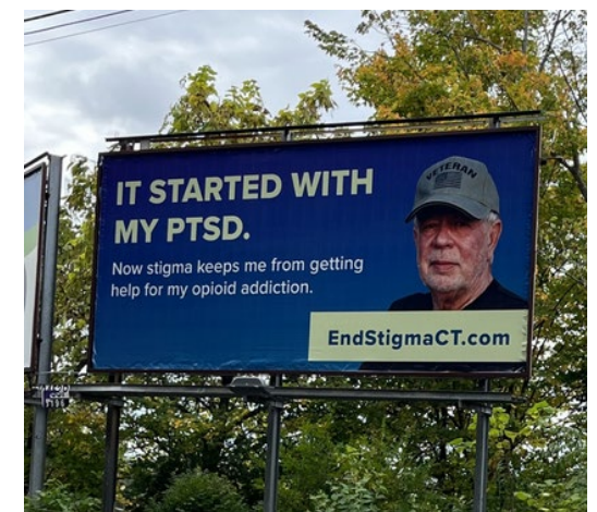
Main St. / Columbia St. - Ansonia