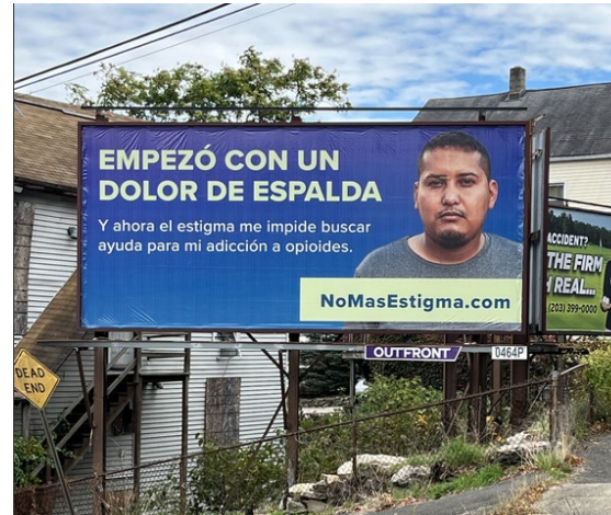
Howe Ave. / Maple St. - Shelton