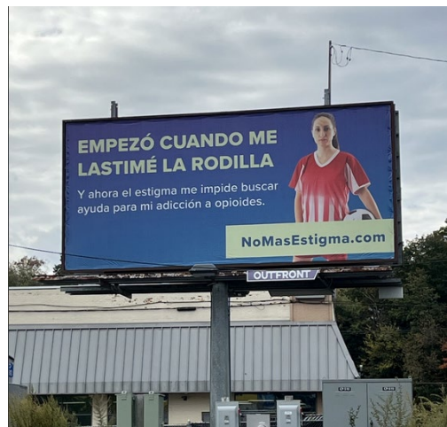
Division St. / Pershing Dr. - Ansonia Division St. / Pershing Dr. - Ansonia